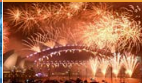
New Year Celebration