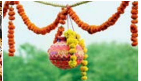
Gokulashtami – Dahi Handi Celebration