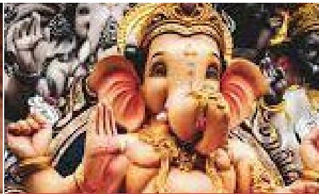
Ganesh Visarjan 5 Day (Special Lunch Arrangement)