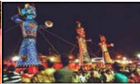
Dashera Puja Before One Day Khande Navmi